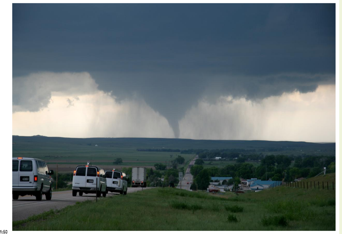
Data from field studies