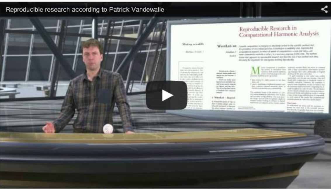
Set to HD quality for the best viewing experience.