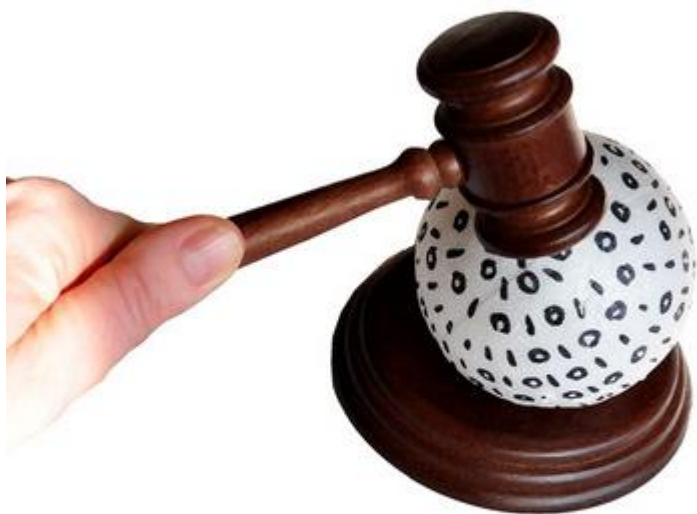
Data and legislation