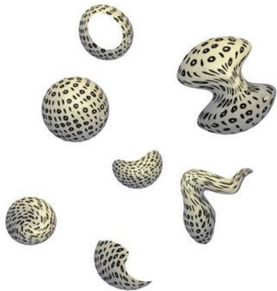
Types of research data