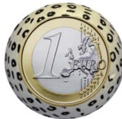
How do the costs for archiving research data relate to the benefits?